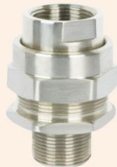
Steel pipe wiring