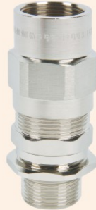
Steel pipe wiring