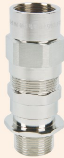
Steel pipe wiring